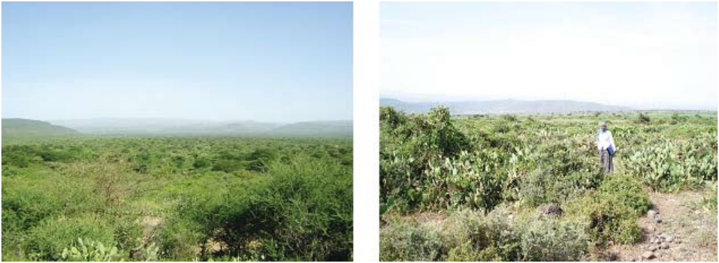
Figure 2. Pastoral (left) and agro-pastoral (right) production system in Mieso district.