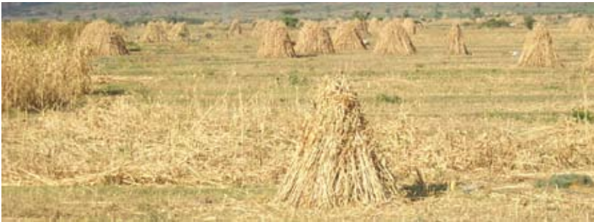
Figure 5. Conservation of sorghum stover in the field ( Kusa ).

The respondents also indicated that they practice feed conservation for dry season feeding. Feed is conserved in the form of what is locally known as Kusa (Figure 5), which is made by storing crop residue on the farm field (from sorghum only) in triangular form in an open system without any cover. This type of feeding is practised from crop-harvesting to end of the dry season. This storage system exposes the feed to moisture causing wastage through fermentation and insect pests. Due to the poor storage system, farmers often fail to get adequate conserved feed to take them up to the end of the dry season.