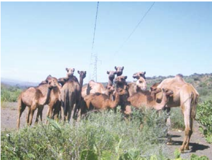
Figure 4. Cattle, goats and camels are important dairy animals in Mieso district.