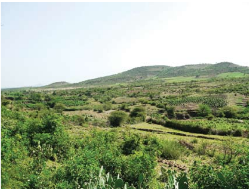
Figure 3. Crop–livestock production system in Mieso district.