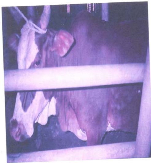
Lumpy Skin Disease